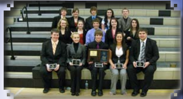
2010 Class B Speech Champions Richardton-Taylor High School