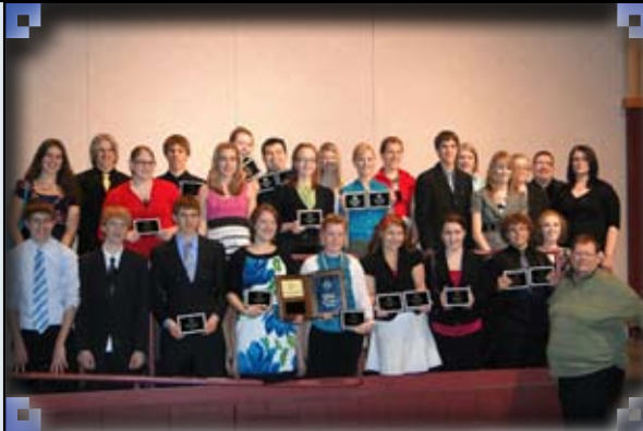
2010 Class A Speech Champions Mandan High School