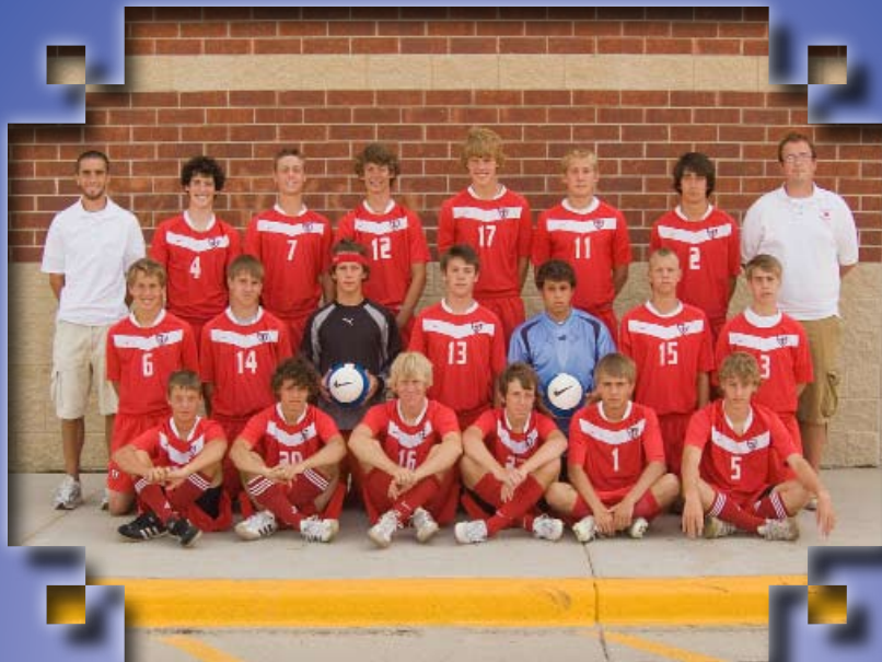
Pictured above are the 2008 Boys' Soccer Champions - Fargo Shanley