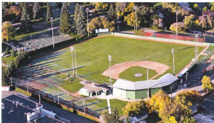
JACK BROWN STADIUM JAMESTOWN, ND JUNE 2-4