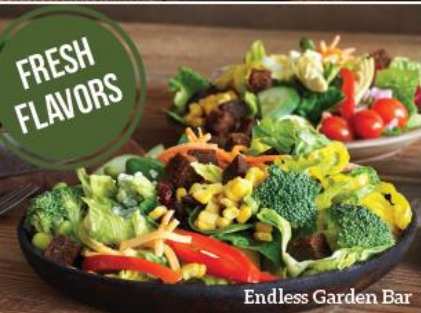
Endless Garden Bar