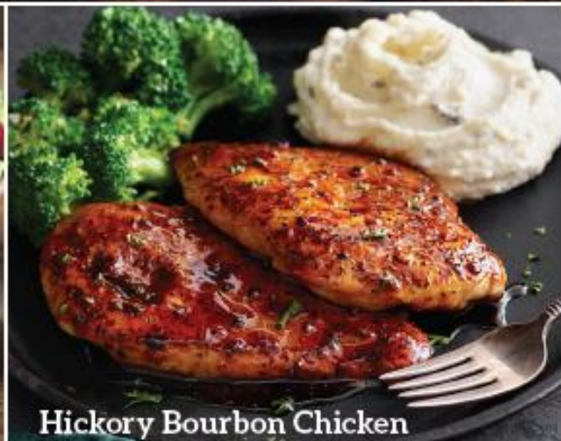
Hickory Bourbon Chicken